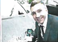
Chauffeur slapped with £500 phone bill