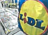
Polish workers at Lidl told to stop work