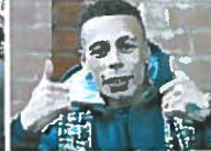
'Besotted' female prison officer had affair with inmate