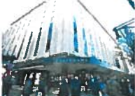
Shoppers watch in horror as man kills woman in supermarket