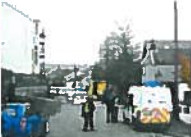
'Hannibal Lecter' killer dies in police car