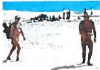
Ebola scare on Canary Island nudist beach